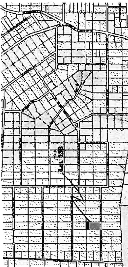
Viability Map - Not to any scale

PLAT NOTES: REC = RECORDS OF COCONINO COUNTY M = INSTRUMENT NUMBER THE PURPOSE OF THIS SURVEY AND PLAT IS TO SUBDIVIDE LOT 138 INTO FOUR NEW PARCELS AS SHOWN AND TO DEFINE THEM FOR RECORDATION PURPOSES AS LOTS 138A, 138B AND 138C. THIS SURVEY BASED ON FOUND MONUMENTS AS NOTED AND PLAT OF KAIBAB ESTATES WEST, ANNEX NO. 3, AS RECORDED AT CASE 2 MAP 8, RECORDS OF COCONINO COUNTY, UNDER PART HEREOF BY THIS REFERENCE AND SHOULD BE CONSULTED FOR RECORD DIMENSIONS. BASIS OF BEARINGS IS GEODETIC AZIMUTH BASED ON GPS OBSERVATIONS. ANY MONUMENTED LINE NOTED HEREON WERE BY GPS BEING RECORDED BY ASSASSIN (GPS). LOT 138, KAIBAB ESTATES WEST ANNEX NO. 3, AS SHOWN ON THE PLAT THEREOF, RECORDED AT CASE 2 MAP 8, RECORDS OF COCONINO COUNTY, ARIZONA. CURRENT ZONING IS R. CURRENT OWNERS: ALICIA GARCIA JIMENEZ - 25X ANA MARIA APARICIO SALAZAR - 25X GLORIA VALANZUELA - 25X PAULA ZEPEDA - 25X PALM RESORT, CA 92280