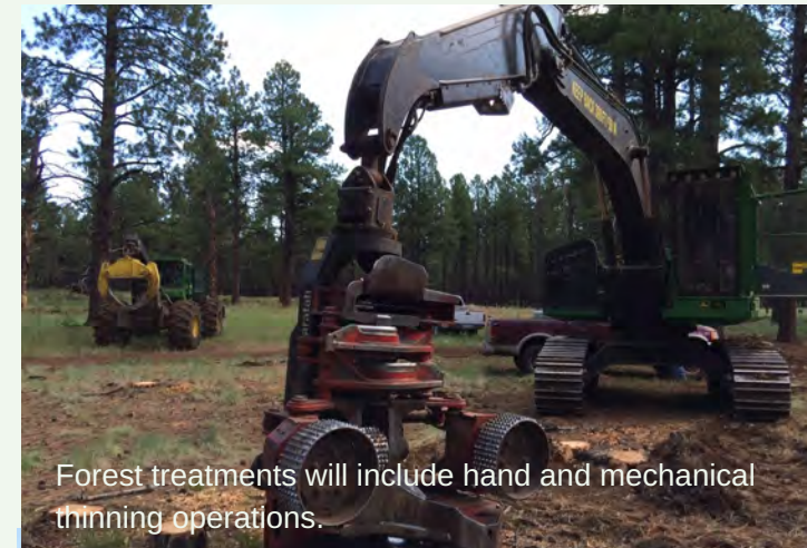
Forest treatments will include hand and mechanical thinning operations.

Coconino County has two grants available for this project that expire in September and December 2017.