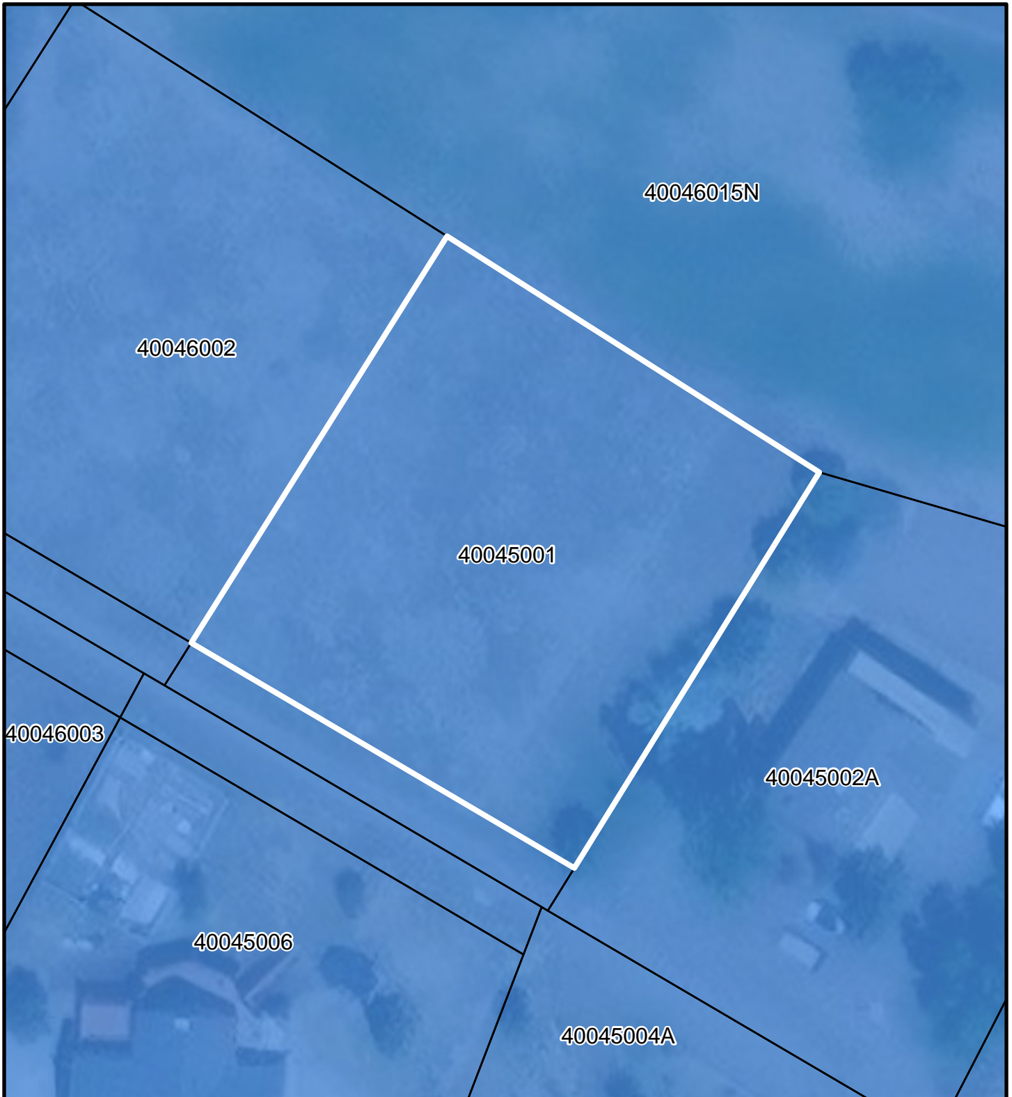
Map 2 - New Preliminary Flood Map - APN: 40045001