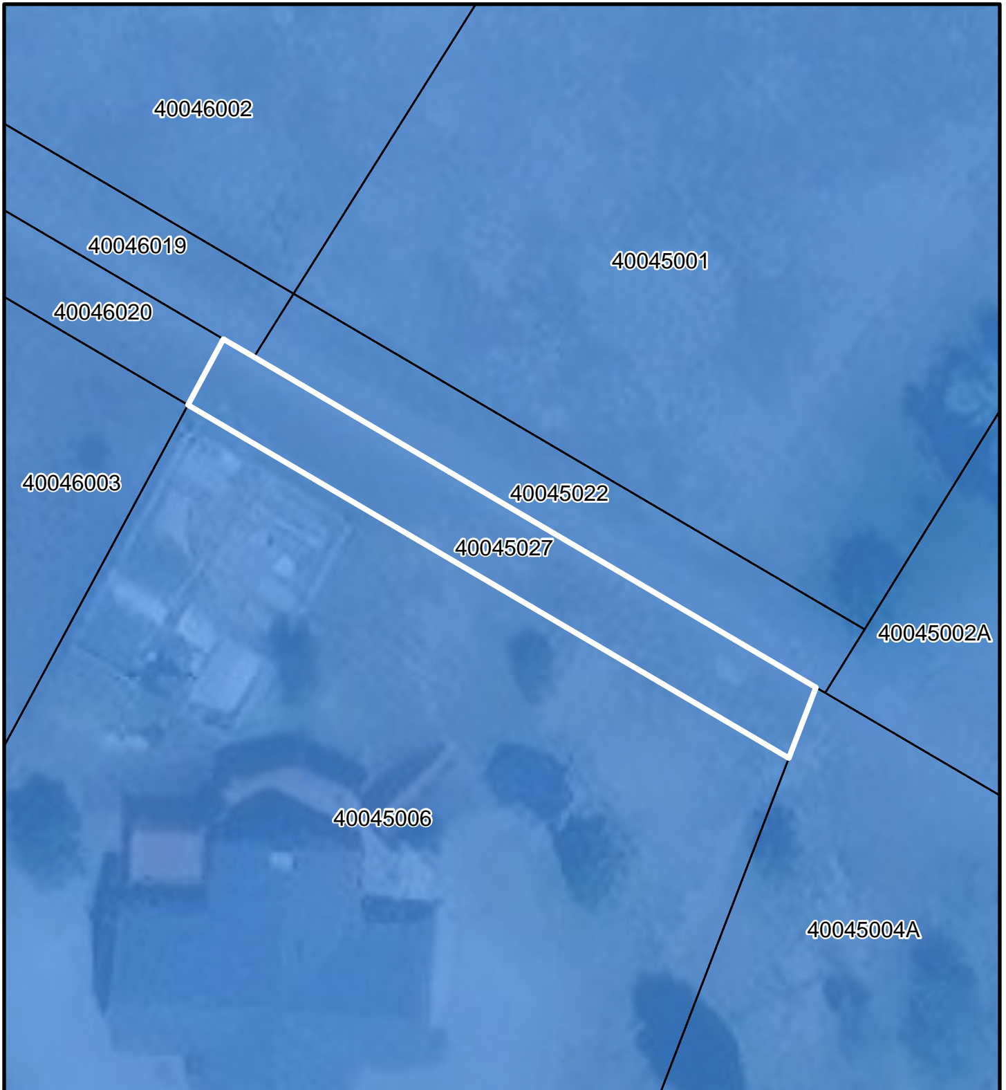
Map 2 - New Preliminary Flood Map - APN: 40045027