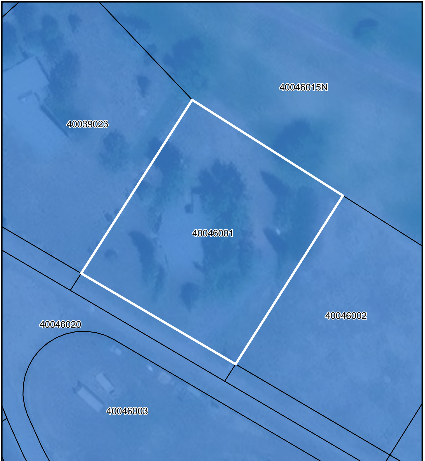
Map 2 - New Preliminary Flood Map - APN: 40046001